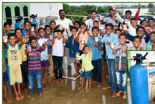
Happy children with clean drinking water!

These needs were addressed by our board and the project was completed last December . As you can see from the photos, the boys at the home were excited to get this new equipment that will help keep them safe and healthy!