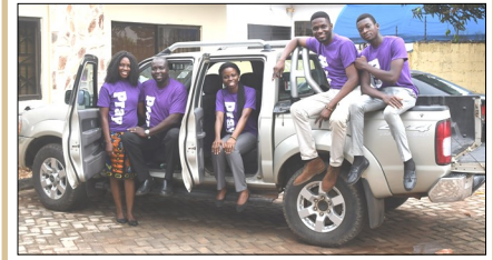
Ghana Ministry Team

740 REACHING AFRICA'S UNREACHED (RAU) , a ministry that works in the West Nile region of Uganda, trains pastors and church leaders at their 26-acre site less than a mile from the South Sudan border. Their mission is to foster healthy growth among churches and their leaders and encourage them to be self-propagating, self-governing, and self-supporting.