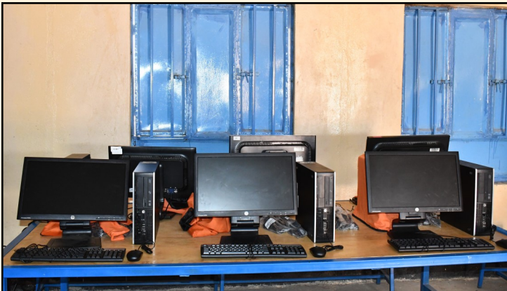
Computers, laptops, and printers were gratefully received by the students and teachers

The education that students receive at school will enhance their future employment possibilities and the Christ-like love they are shown and taught by their teachers will reap eternal rewards!