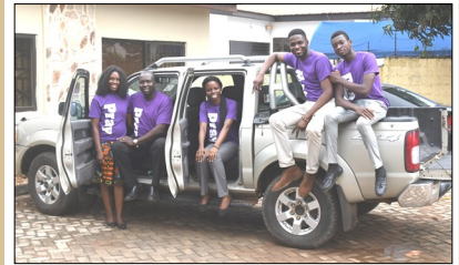
Ghana Ministry Team

740 UGANDA REACHING AFRICA'S UNREACHED (RAU) trains pastors and church leaders at their 26-acre site less than a mile from the South Sudan border, encouraging churches to be self-propagating, self-governing, and self-supporting. RAU's Ministry House accommodates missionaries and visiting teaching and medical teams. They recently added a living area for a new missionary family, but the solar power previously installed for the house is not adequate for their needs and they are "limping along" with this system. Help us raise funds for a solar power upgrade so they can continue serving the church in Uganda!