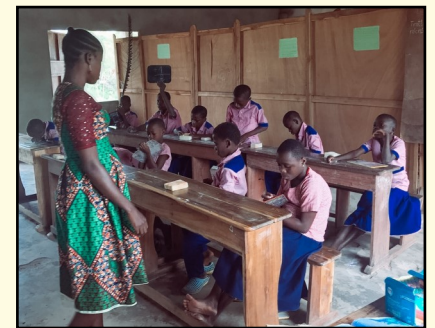
Below: Deaf children at the school

If you will be in the Philadelphia area the weekend of April 27 th , we'd love for you to join us at our 2024 Spring Fundraiser Event in Dresher, PA!