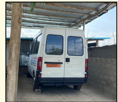
Above: Van parked under new garage

Their letter ended with these words, “We prayed for this van for a long time... From our founders, our board, our staff, our students, and the deaf in West Africa, once again, THANK YOU! ”