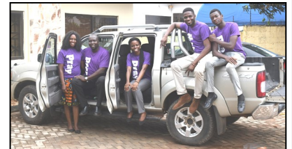
Ghana Ministry Team